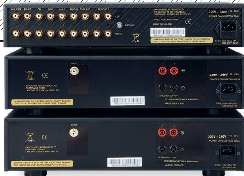
ABOVE: Six line inputs are offered on the preamplifier, with Aux 1 available as a phono stage with optional MM/MC boards fitted. Note bi-wire outlets on the amps

smile. The underpinnings to Mr Scruff's 'Get a Move On' from his Keep It Unreal CD [Ninja Tune ZEN CD42] – which features a steady drum machine beat over a fairly simple bass line – were absolutely rock solid and positively bounded along. This particular bass line can sometimes have a tendency to drift into the background if the driving amplifier lacks a firm guiding hand, but this was not a worry here.